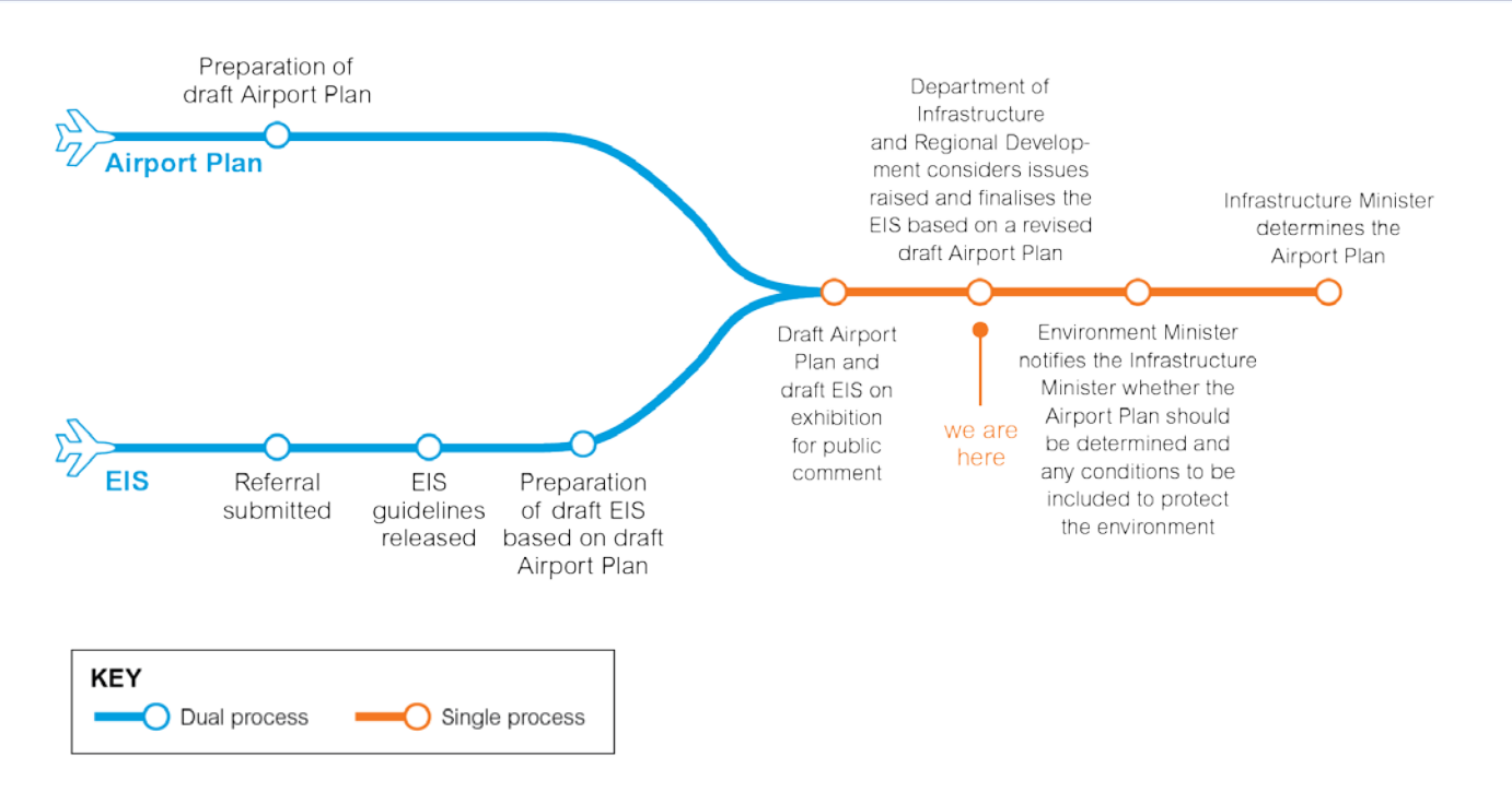
Figure 3–1 Western Sydney Airport approval process