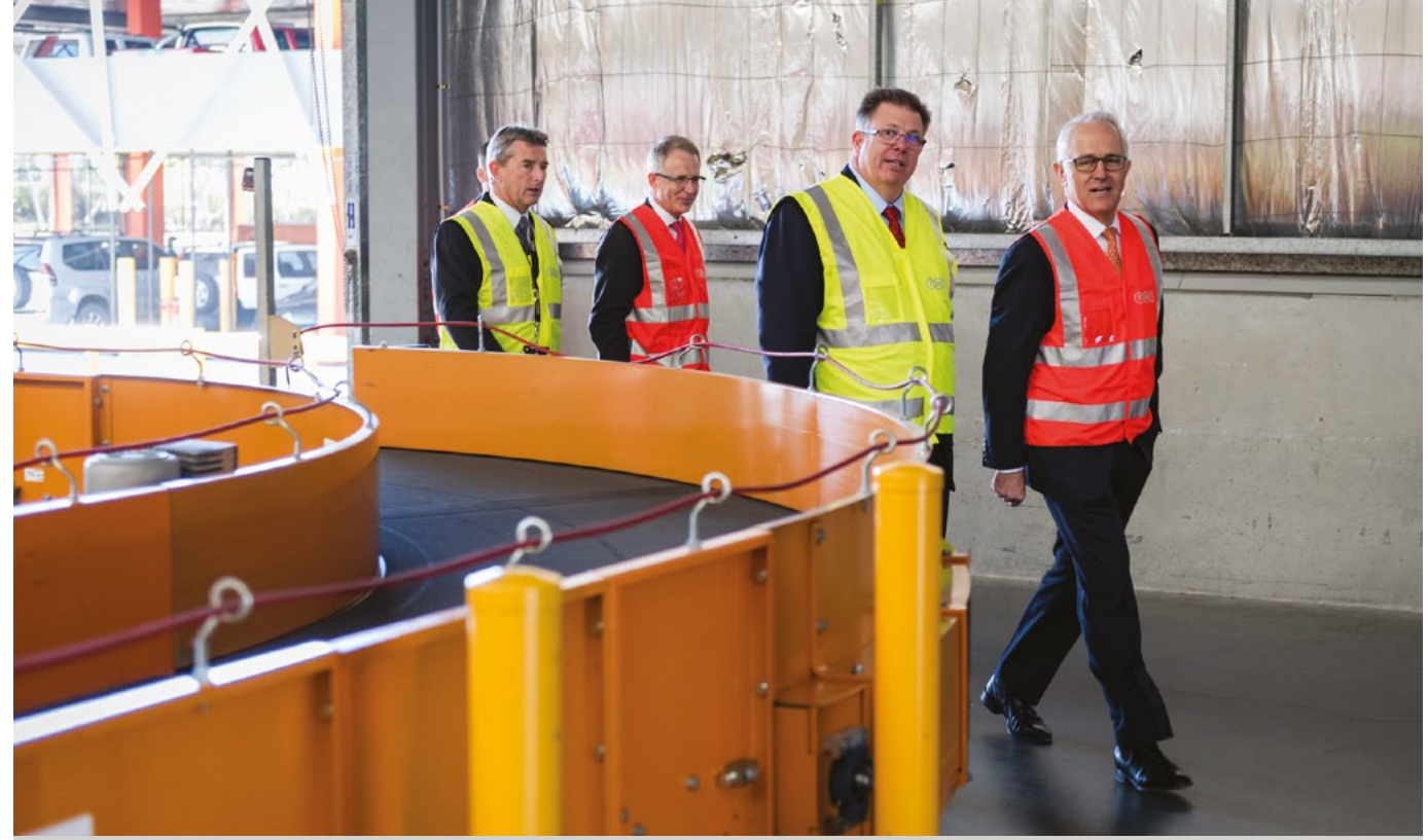
Prime Minister Malcolm Turnbull and Minister for Urban Infrastructure Paul Fletcher in Western Sydney, launching the Western Sydney Airport Labour Market Analysis report.