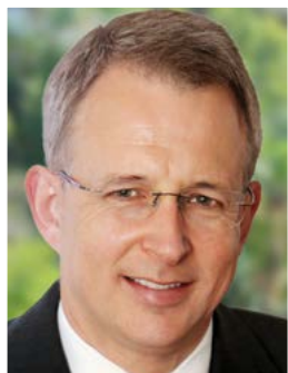
Paul Fletcher Minister for Urban Infrastructure and Cities

In March, I joined the Prime Minister, the NSW Premier, and eight Western Sydney mayors for the signing of the Western Sydney City Deal. The City Deal is a long-term plan for the development of Western Sydney - with a particular focus on how to maximise the business-attracting, jobs-generating power of the Commonwealth's $5.3 billion investment in Western Sydney Airport.