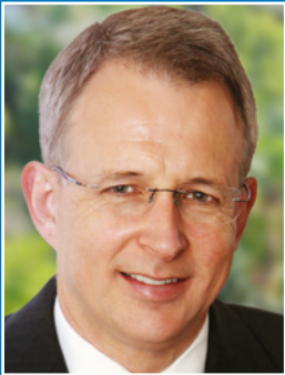
Paul Fletcher Minister for Urban Infrastructure