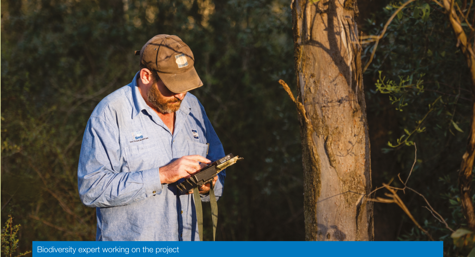
Biodiversity expert working on the project